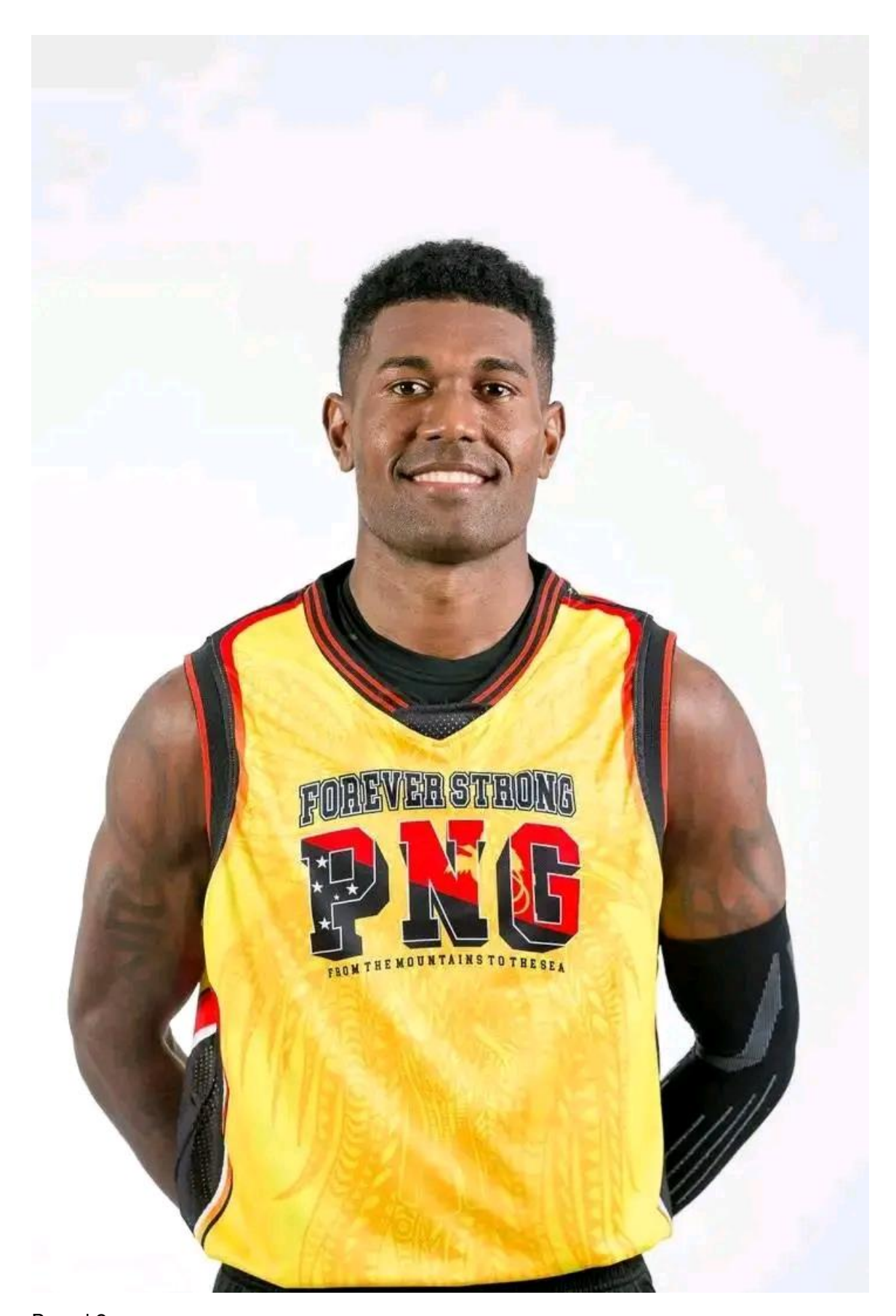
Page | 9