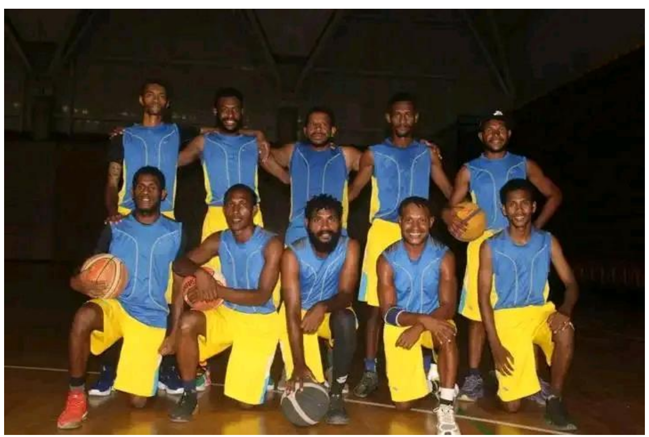
Equalizers Men's team

Youths from the back end at Bomana, outside of Port Moresby City has seen positive Impact of sports in their small community. Despite not having a structural youth group or association the youths from far end of Bomana decided to register basketball club in Port Moresby Basketball Association to keep them busy and free from social activities and issues such as alcohol and drug related problems, violence in society and pity crimes.