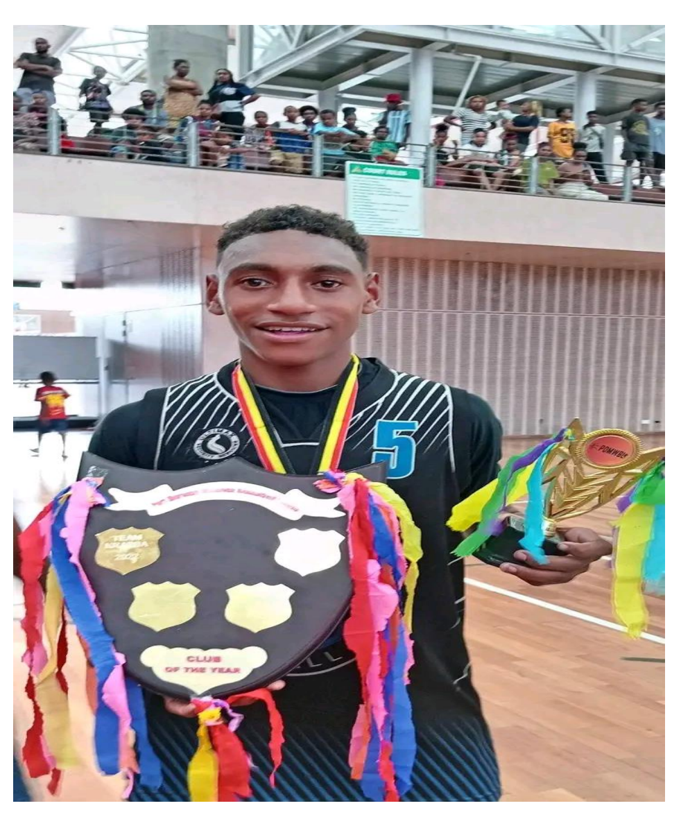
Page | 4