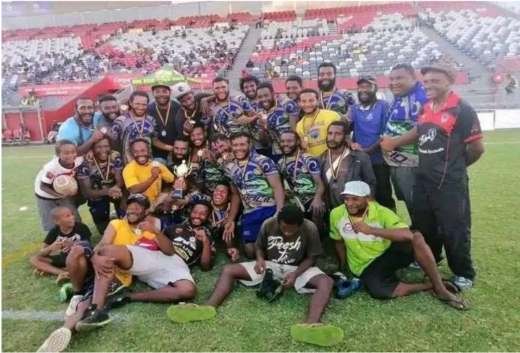
Waidex players and coaching staff celebrating after their win